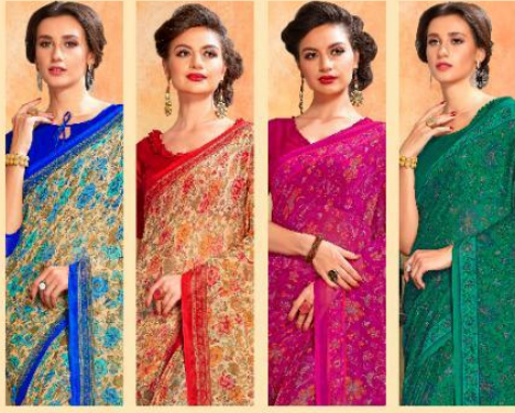
7301a 7301b 7302a 7302b