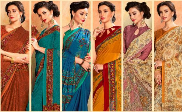
7305a 7305b 7306a 7306b 7307a 7307b