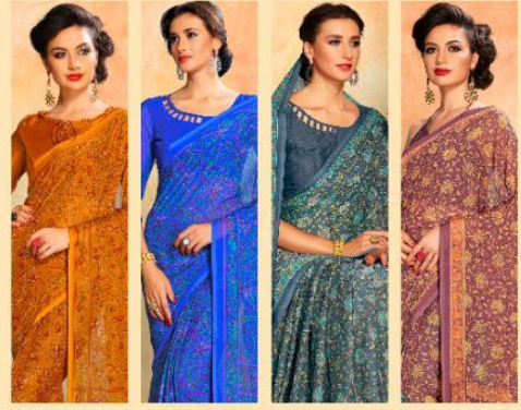
7303a 7303b 7304a 7304b