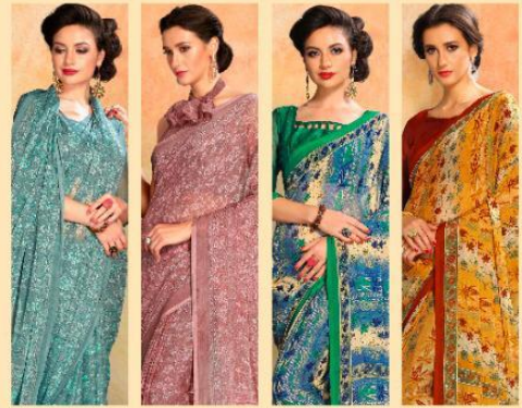
7308a 7308b 7309a 7309b