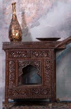
Image IS EVERYTHING "I THINK THERE IS BEAUTY IN EVERYTHING. WHAT NORMAL PEOPLE PERCEIVE AS UGLY, I CAN USUALLY SEE SOMETHING OF BEAUTY IN IT." 1003