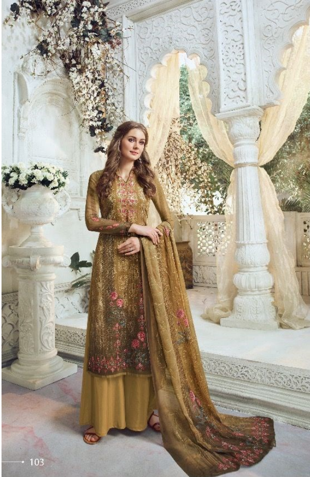
The idea of a woman for the independent, strong and outstanding women of today.