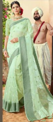
DESIGN NO. 57002