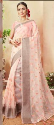
DESIGN NO. 57004