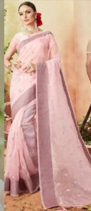
DESIGN NO. 57001