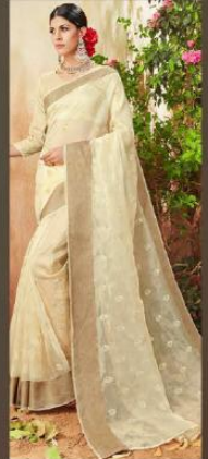
DESIGN NO. 57003