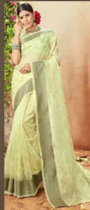
DESIGN NO. 57005