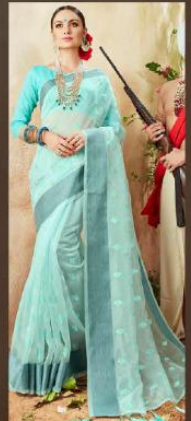
DESIGN NO. 57006