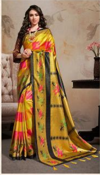
SH-51 (STAR SILK)