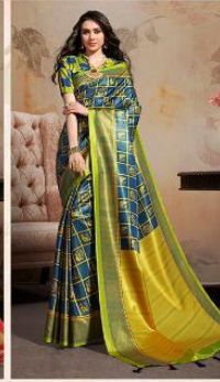
SH-59 (STAR SILK)