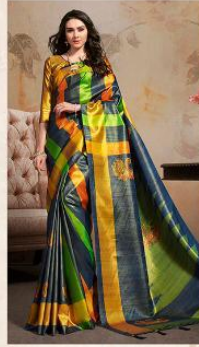
SH-57 (STAR SILK)