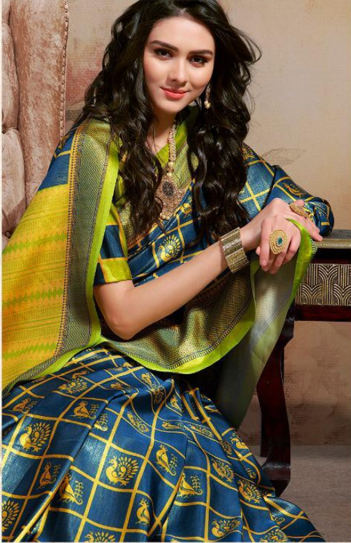
By dressing with such splendor, you tell the world that your tastes are immaculate and miles ahead of your contemporaries. A true monarch of style.