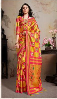
SH-52 (STAR SILK)