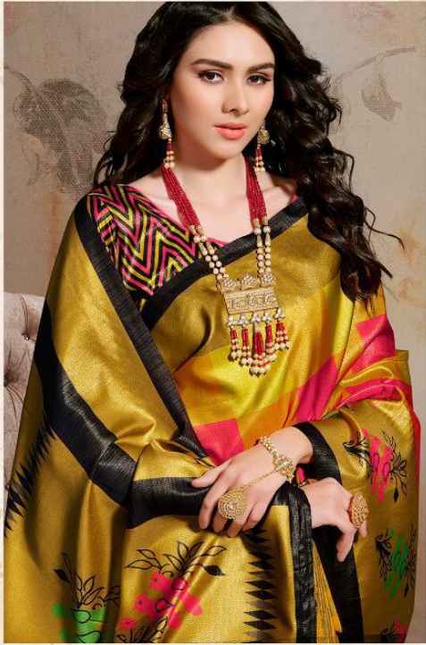
Of all the things in heaven and earth that man holds close to his heart, when you look as you do in these threads...he holds nothing dearer. Be above the rest.