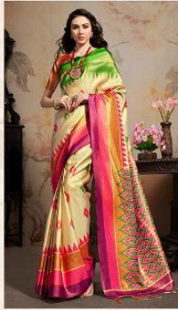
SH-55 (STAR SILK)