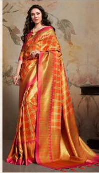
SH-56 (STAR SILK)