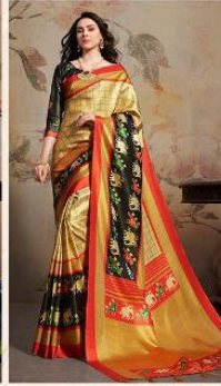
SH-58 (STAR SILK)