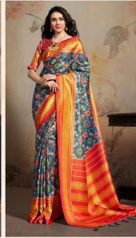
SH-61 (STAR SILK)