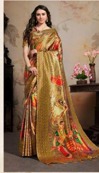
SH-60 (STAR SILK)