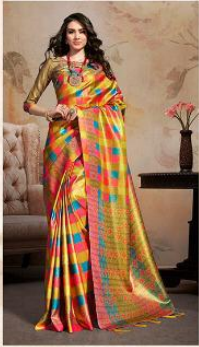
SH-54 (STAR SILK)