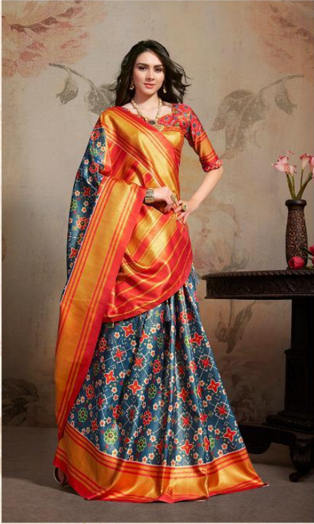
In the turbulent world of today, your magnificence is the one constant. Little do they know your secret- the magic of your threads.