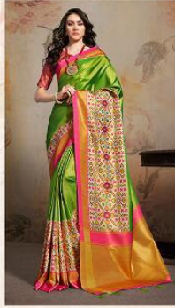
SH-53 (STAR SILK)