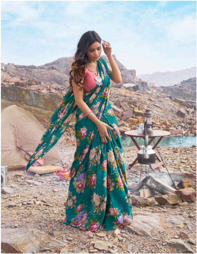
D.NO.30351 WALK WITH CONFIDENCE