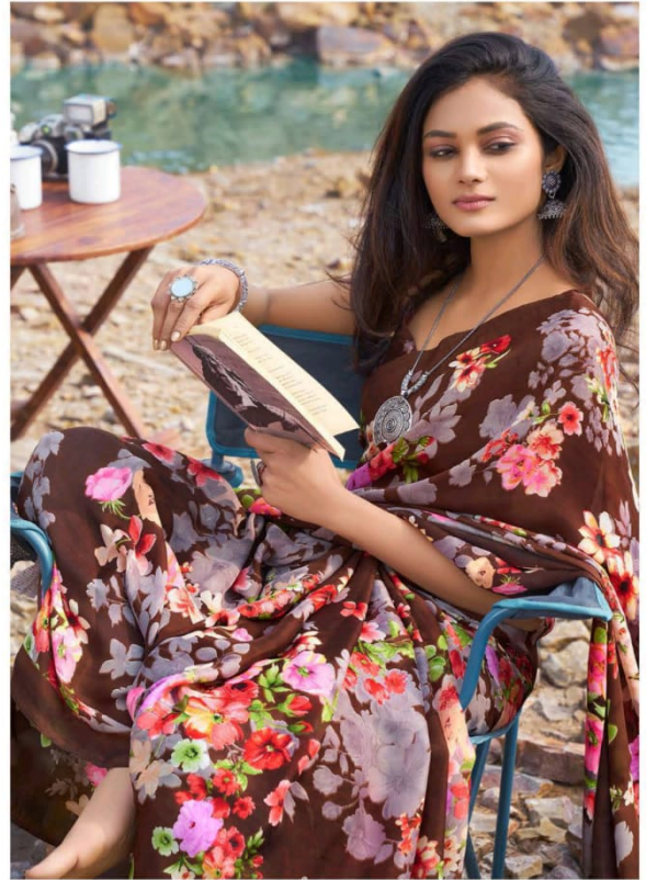
SWANKY ATTIRE FOR CLASS D.NO.30347