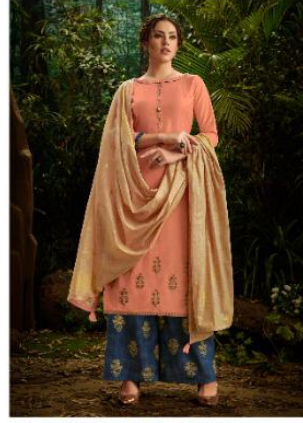
CODE # 24003