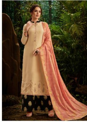
CODE # 24006