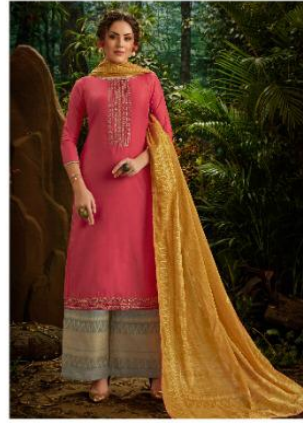
CODE # 24007