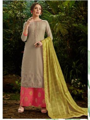
CODE # 24008