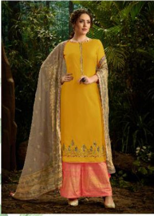
CODE # 24005