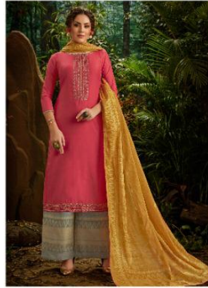
CODE # 24007