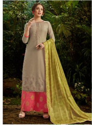
CODE # 24008