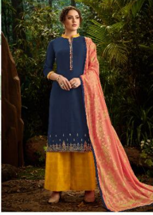
CODE # 24001