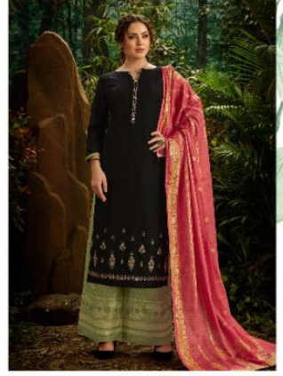
CODE # 24004