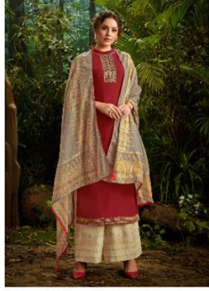
CODE # 24002