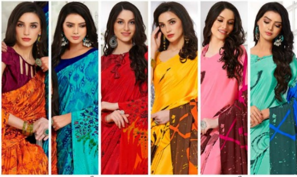
7501a 7501b 7501c 7502a 7502b 7502c