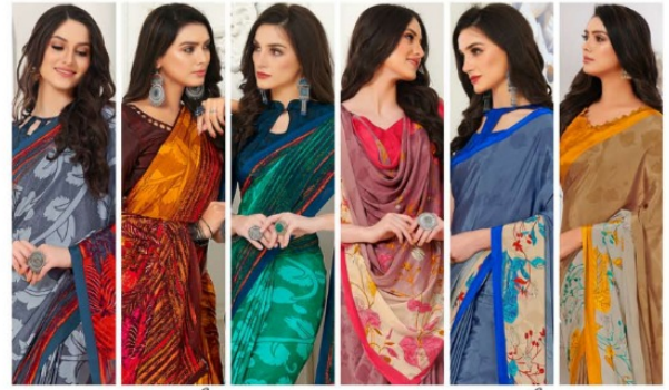
7503a 7503b 7503c 7504a 7504b 7504c