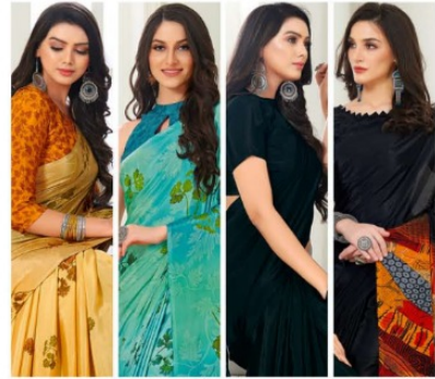
7507a 7507b 7508a 7508b