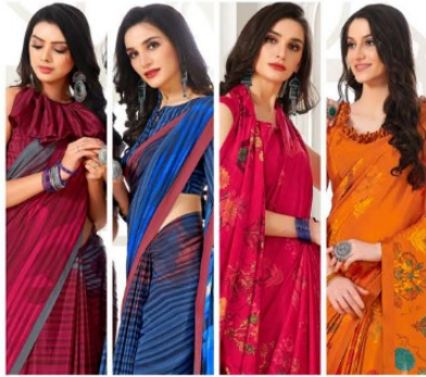
7505a 7505b 7506a 7506b