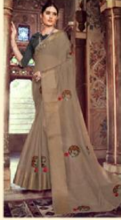
D.NO. - 3936