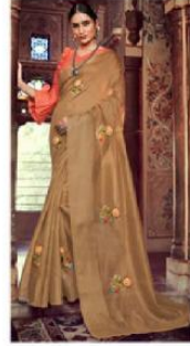
D.NO. - 3938