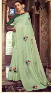
D.NO. - 3937