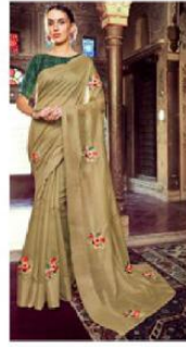
D.NO. - 3933