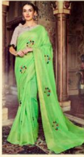
D.NO. - 3931