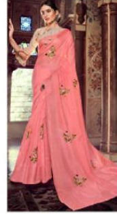
D.NO. - 3940