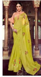
D.NO. - 3934