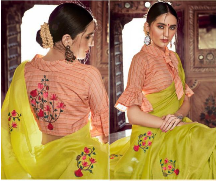
D. NO. - 3934