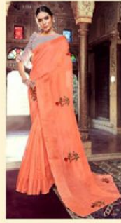
D.NO. - 3932