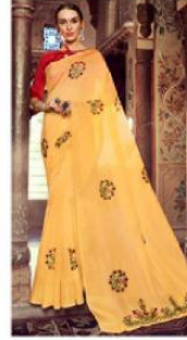
D.NO. - 3939