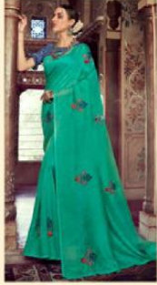
D.NO. - 3935