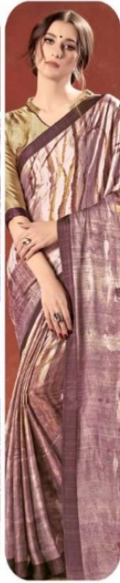
D.NO. 20404 (PRIMIUM CRAP)