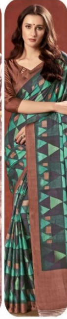
D.NO. 20405 (PRIMIUM CRAP)