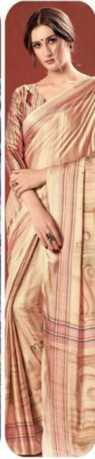
D.NO. 20407 (PRIMIUM CRAP)