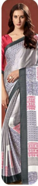
D.NO. 20403 (PRIMIUM CRAP)