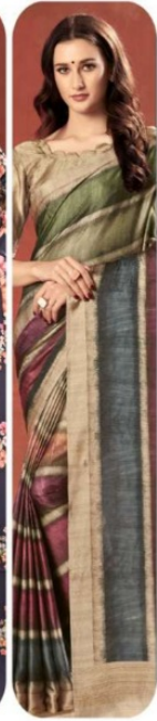
D.NO. 20410 (PRIMIUM CRAP)