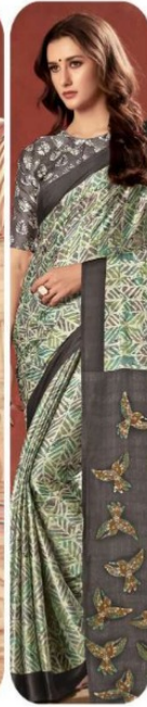
D.NO. 20408 (PRIMIUM CRAP)