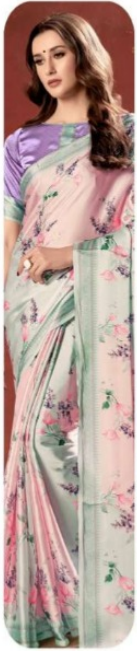
D.NO. 20401 (PRIMIUM CRAP)