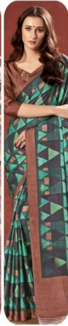
D.NO. 20405 (PRIMIUM CRAP)