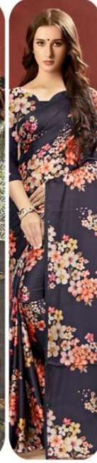
D.NO. 20409 (PRIMIUM CRAP)