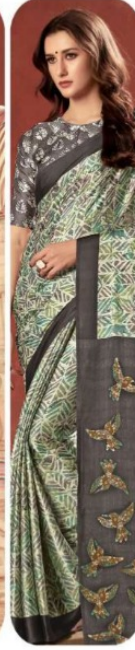
D.NO. 20408 (PRIMIUM CRAP)