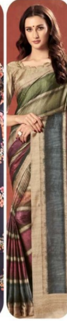
D.NO. 20410 (PRIMIUM CRAP)