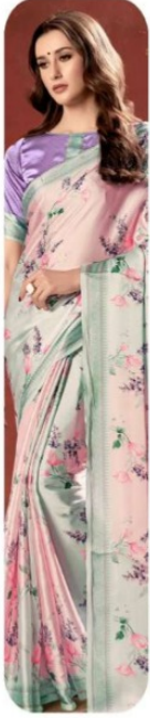
D.NO. 20401 (PRIMIUM CRAP)