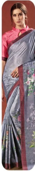
D.NO. 20406 (PRIMIUM CRAP)