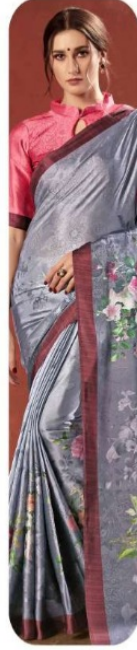
D.NO. 20406 (PRIMIUM CRAP)