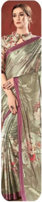
D.NO. 20402 (PRIMIUM CRAP)