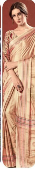
D.NO. 20407 (PRIMIUM CRAP)