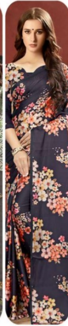
D.NO. 20409 (PRIMIUM CRAP)