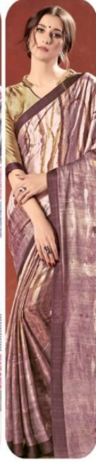
D.NO. 20404 (PRIMIUM CRAP)