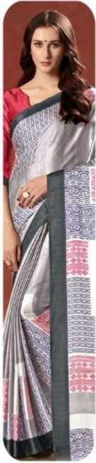
D.NO. 20403 (PRIMIUM CRAP)