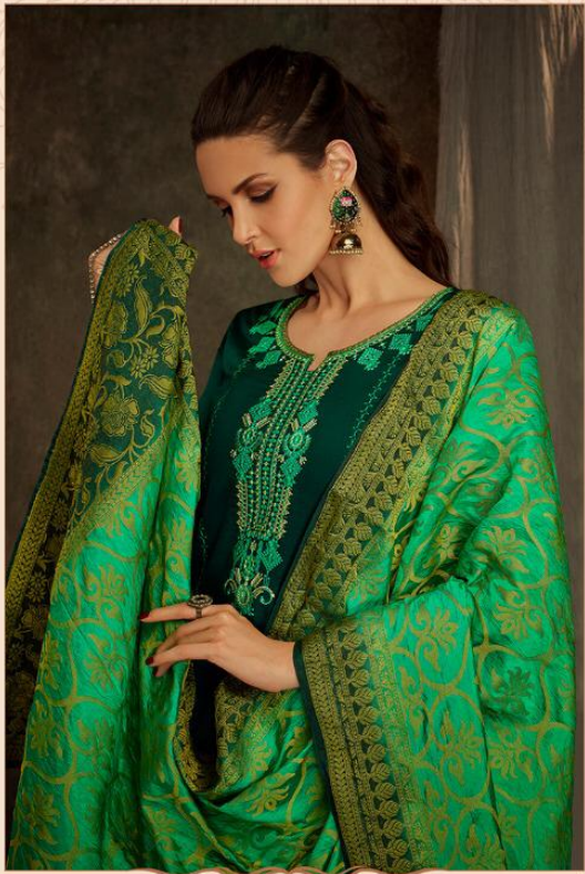
THE SOFT TINTED ADDITIONS OFFER THE PERFECT ALTERNATIVE FOR A FEMININE & CLASSY LOOK.