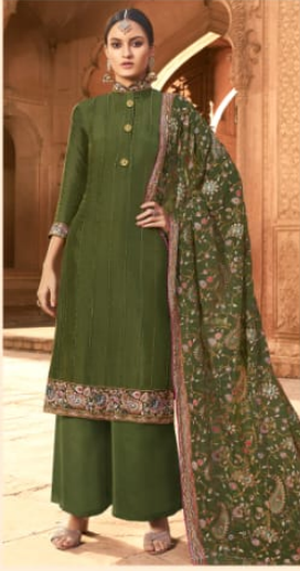
* 1001 *