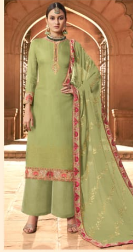
* 1003 *