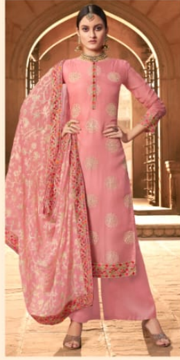
* 1002 *