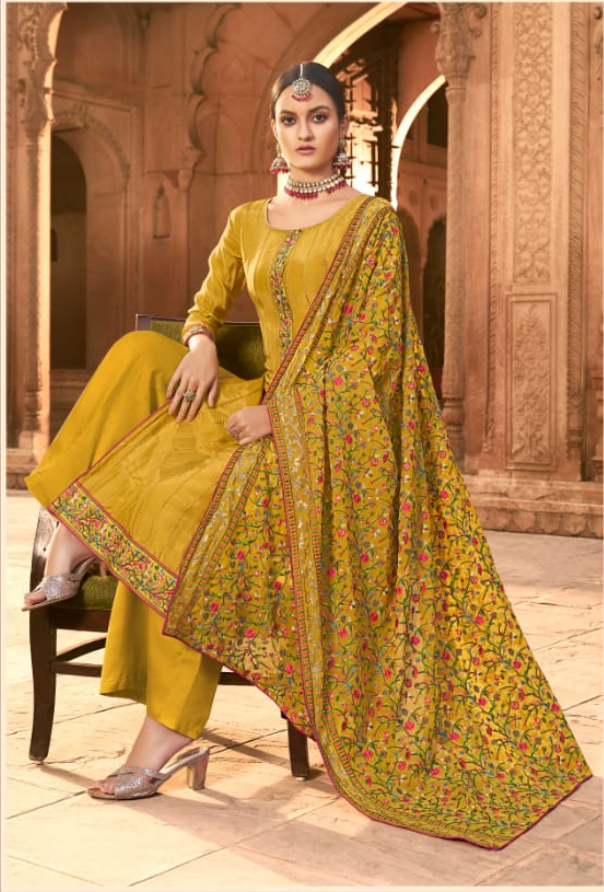
* 1004 *