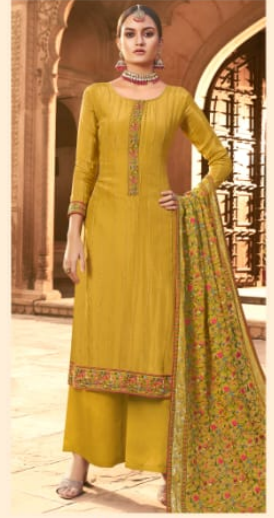
* 1004 *