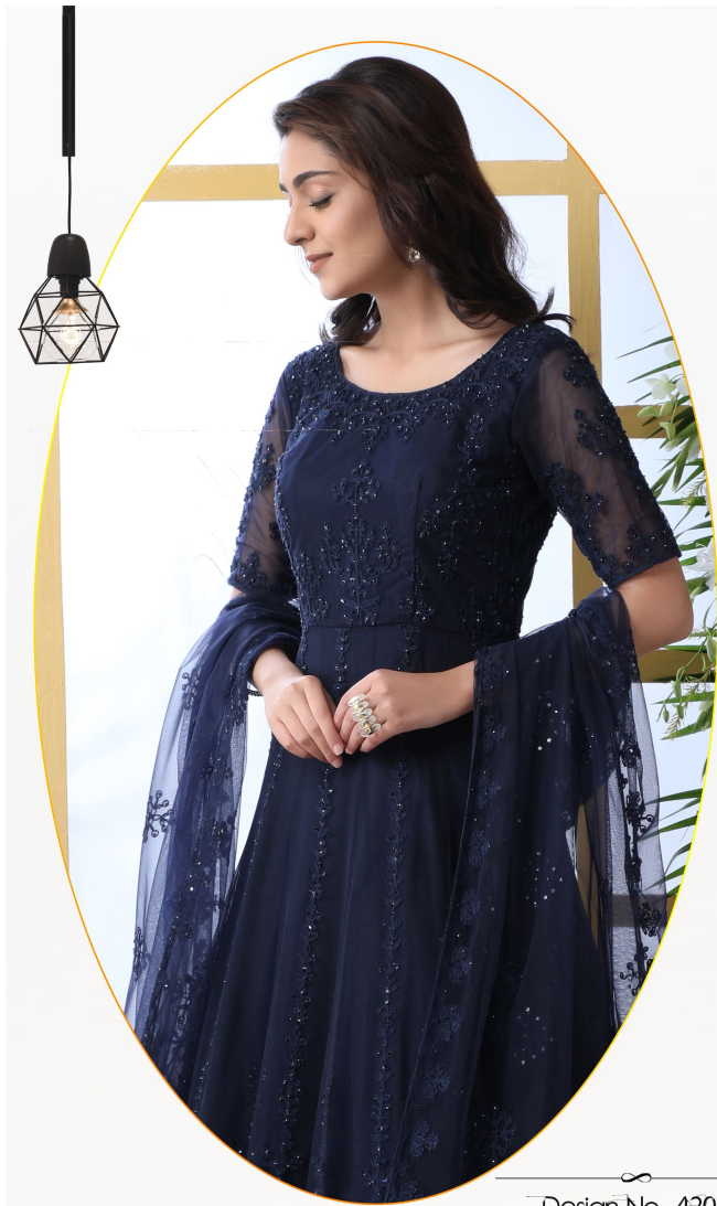
Design No. 4204