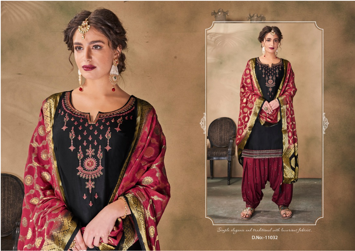
Simple elegance and traditional with luxurious fabric.