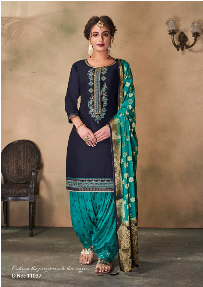
Embrace the purest trends this season. D.No:- 11037