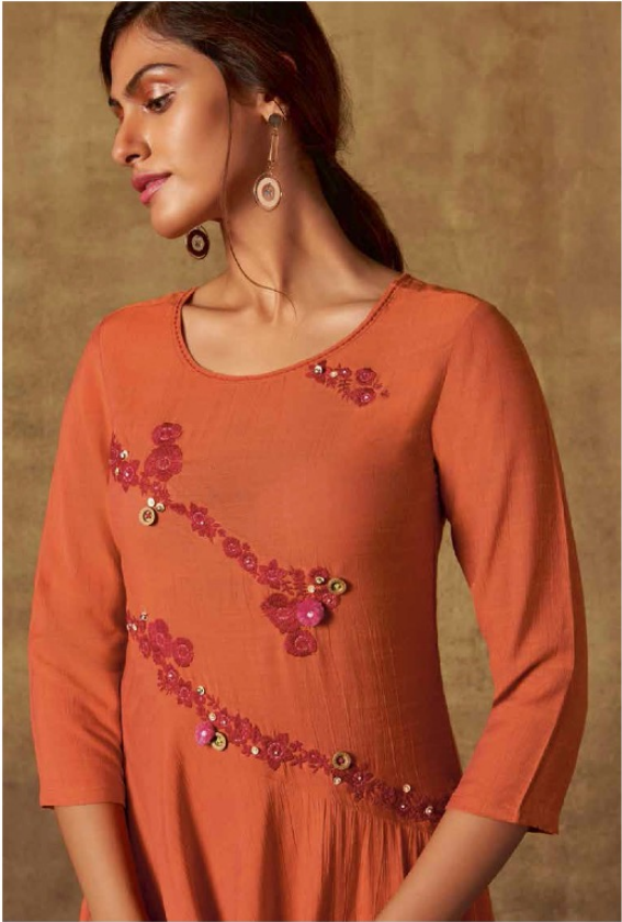
Our elegant design with the flowing sleeves that allow the ease of comfort with graceful of color and once paired hair styling. This look is a complete and elegant expression to our designs and "MIRAZAR"