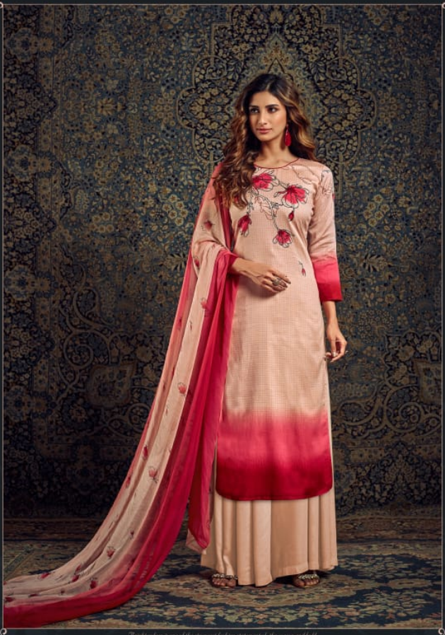
Bright colour is one of the strongest fashion statement of the season and bold designs give fashion a more ethereal and exotic effect.