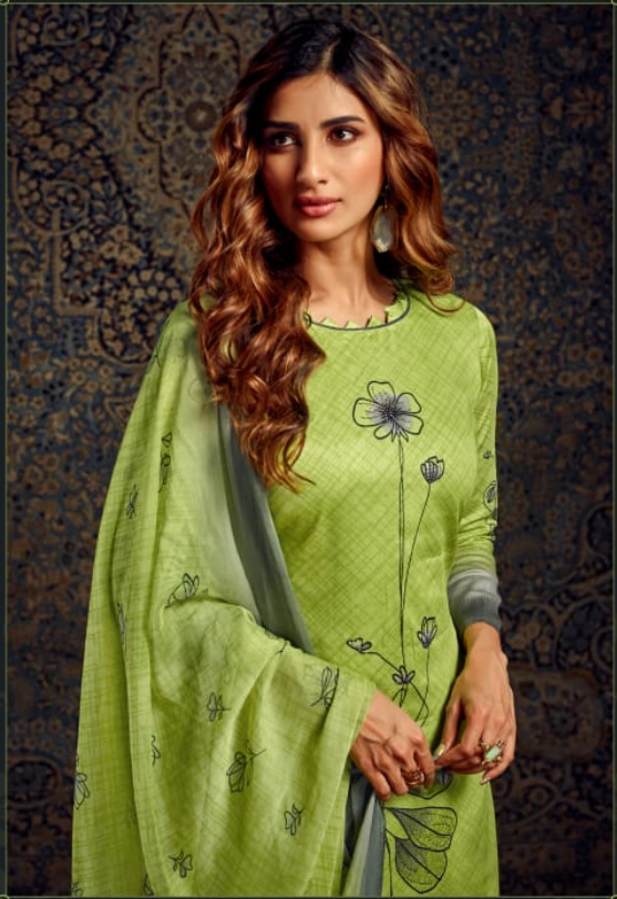
Bright colour is one of the strongest fashion statements of the season and bold designs give fashion a more elevated and exotic effect.