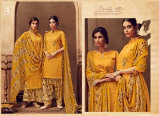
I - 325 - 001