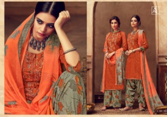
I - 325 - 002