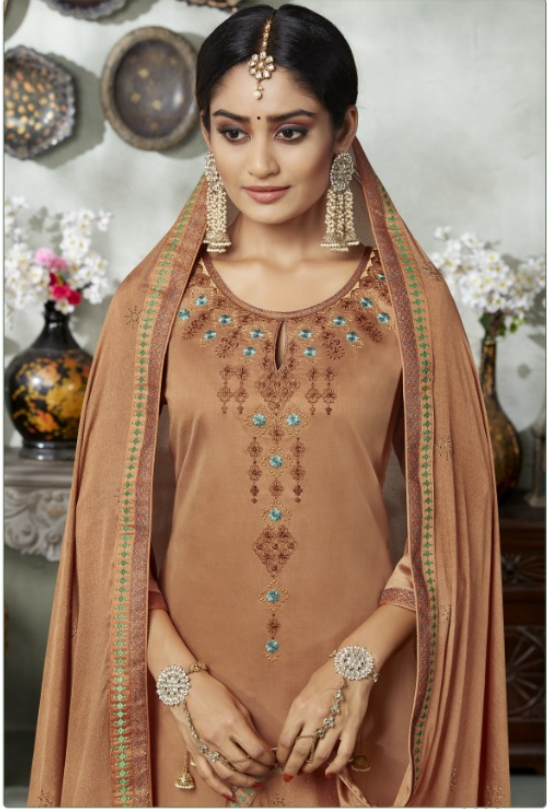
D.NO. 1291 " Simplicity is complexity resolved. ,,