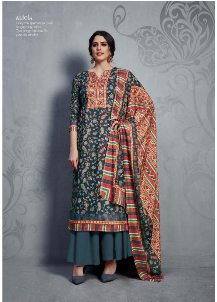
Alicia Enjoy the spectacular print on gripping colour That brings chirena To your personality.