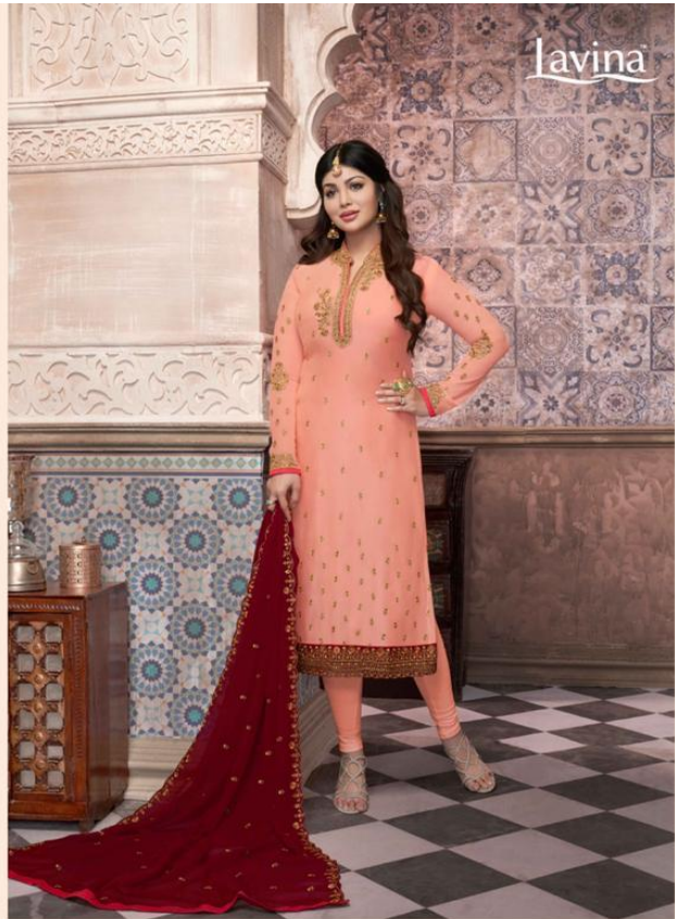
Feel absolute gorgeous in this stunning dress with delicate fabrics and eye-catching designs. Classy and so traditional. 86004