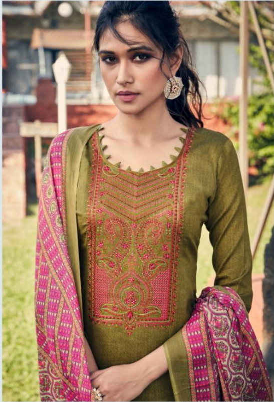
TURN EVERY HEAD YOUR WAY AS YOU STROLL ACROSS IN AN OUTFIT FROM THE NEW ETHNIC COLLECTION CELEBRATE YOUR CLASSY SIDE WITH THIS PERFECT FOR CHIC STYLE