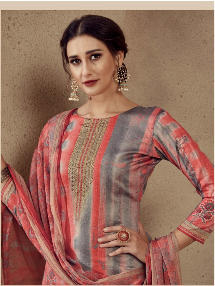
A gorgeous dress with contemporary design would add freshness and stunning glamour to her look