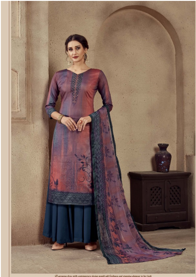
A gorgeous dress with contemporary design would add freshness and stunning glamour to her look