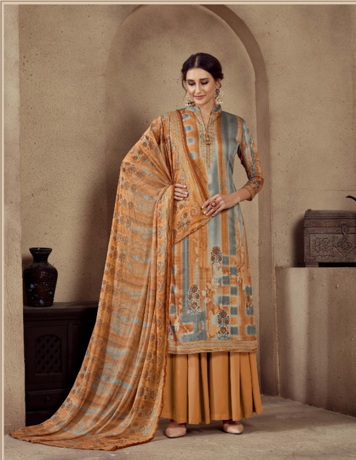
A gorgeous dress with contemporary design would add freshness and stunning glamour to her look