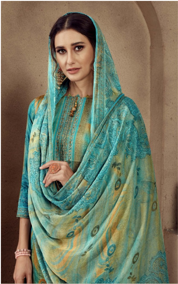
A gorgeous dress with contemporary design would add freshness and stunning glamour to her look