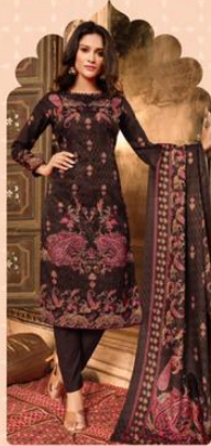
↙ 3007 ↘