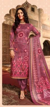
↙ 3003 ↘