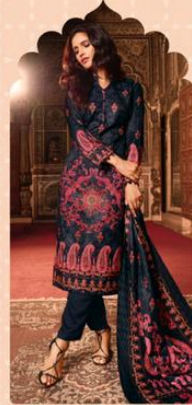
↙ 3008 ↘