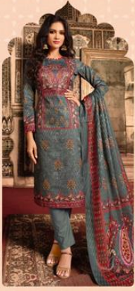
↙ 3001 ↘