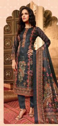
↙ 3005 ↘