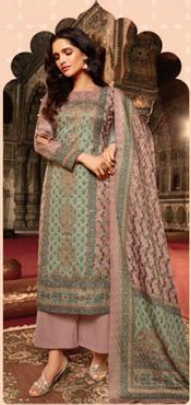
↙ 3006 ↘