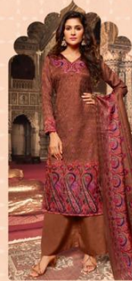
↙ 3009 ↘