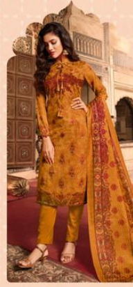
↙ 3004 ↘