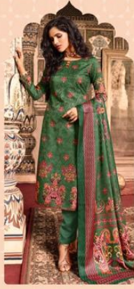
↙ 3002 ↘