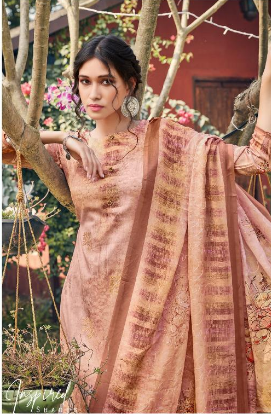
Inspired SHADES this season assortment brings your word noise too close to great looking colours and fantastic patterns...