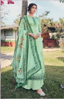
Code # 13801