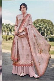
Code # 13804