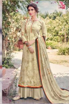
Code # 13803