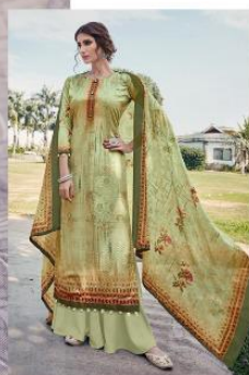
Code # 13808