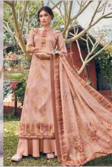
Code # 13802