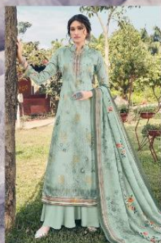
Code # 13807