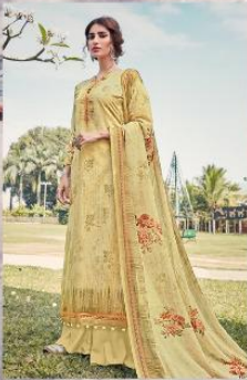
Code # 13805