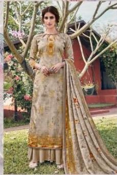
Code # 13806