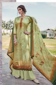
Code # 13808