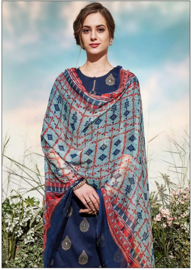
style no. 131-001