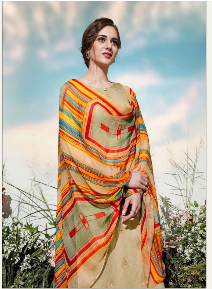
style no. 131-005