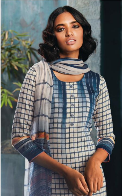
Ganga Amethyst • C0184