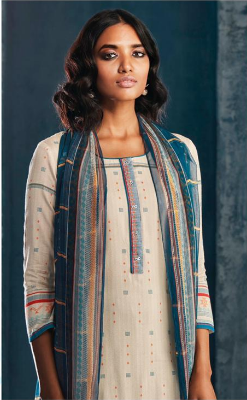
Ganga® Amethyst • C0185