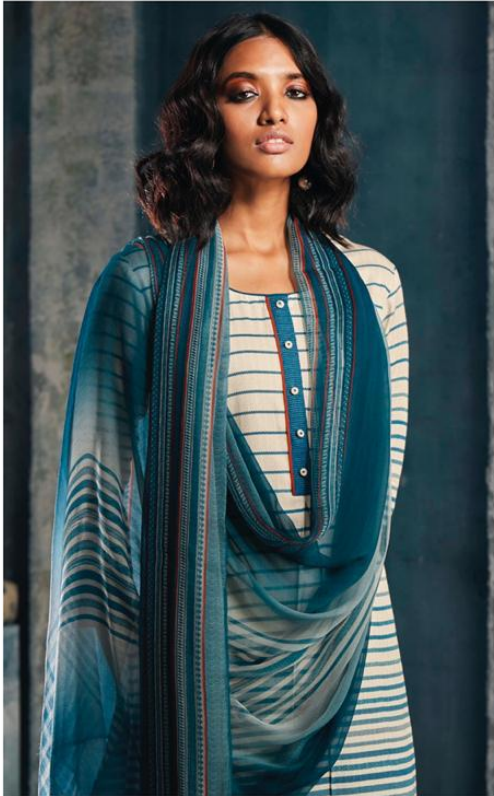
Ganga® Amethyst • C0186