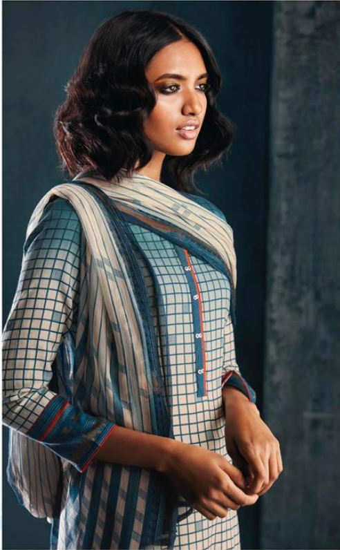
Ganga® Amethyst • C0181