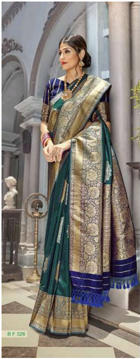
B F 326