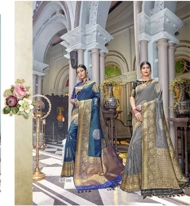
B F 328