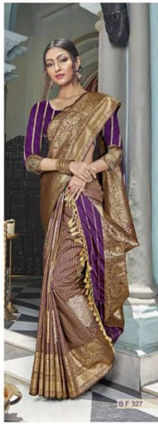
B F 327