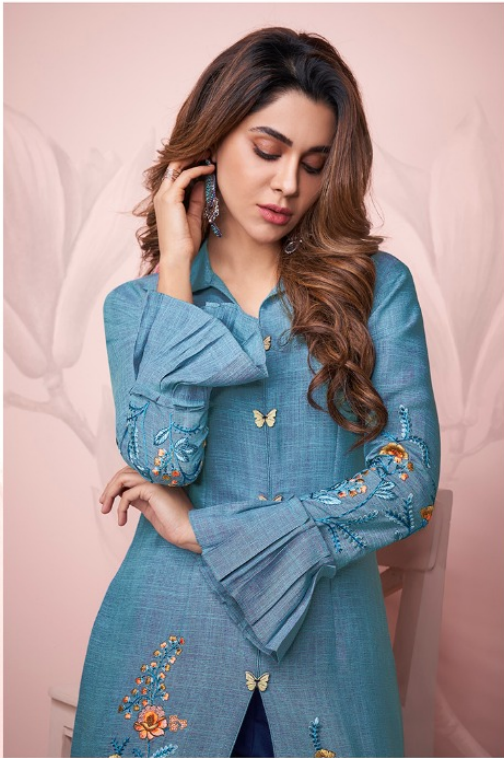
classic styles with luxurious soft fabrics are highlighted by refined and feminine details.