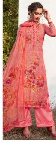
D NO ; 226