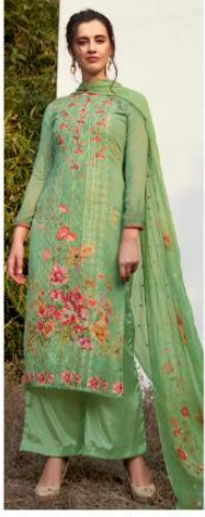
D NO ; 224