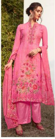
D NO ; 223