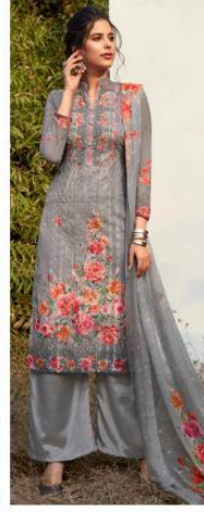
D NO ; 228