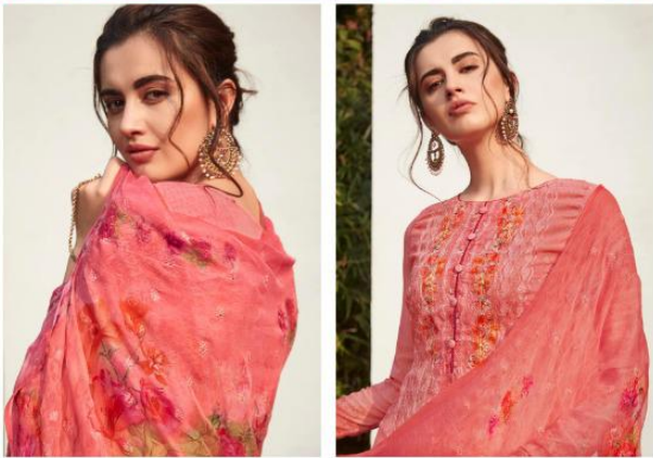
D NO ; 226