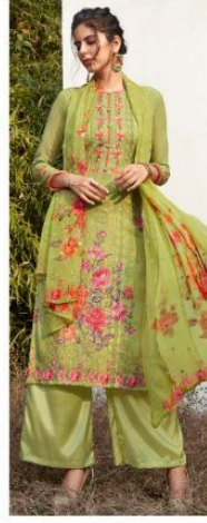
D NO ; 227