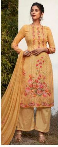
D NO ; 225