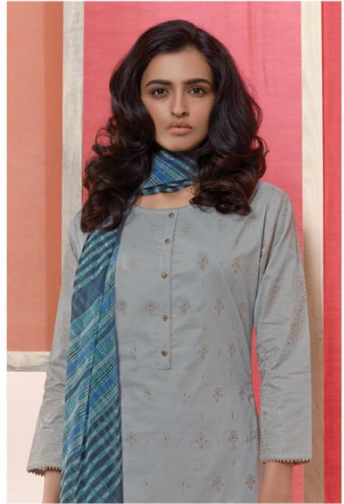
design number | 1034