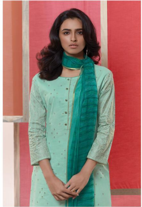
design number | 1036