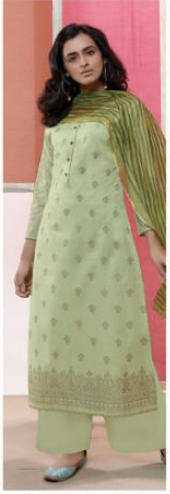
design number | 1031