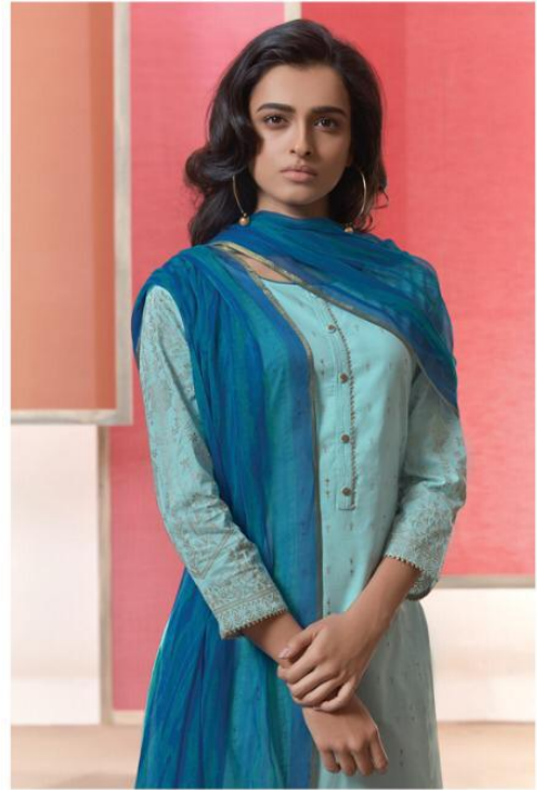
design number | 1032