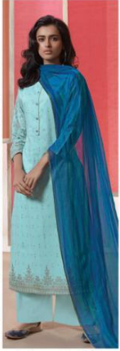
design number | 1032