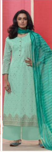
design number | 1036