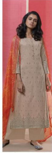
design number | 1035