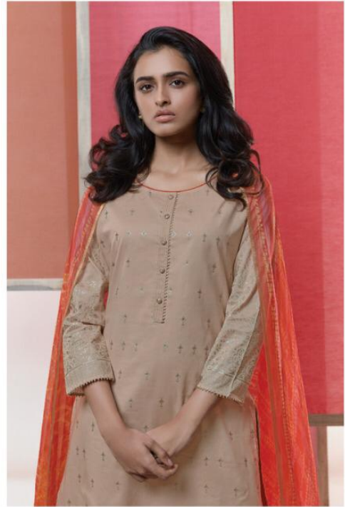
design number | 1035