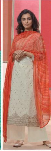
design number | 1037