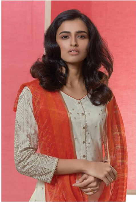
design number | 1037