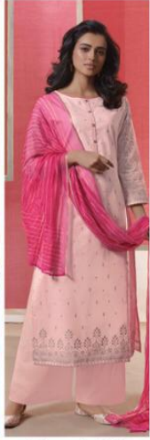
design number | 1033