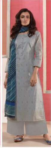
design number | 1034