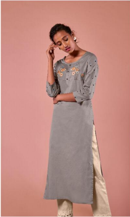
Every individual is an expression of the whole nature of nature is a unique series of the whole universe. This collection is all about colored cotton (cotton) to add a pop to your wardrobe.