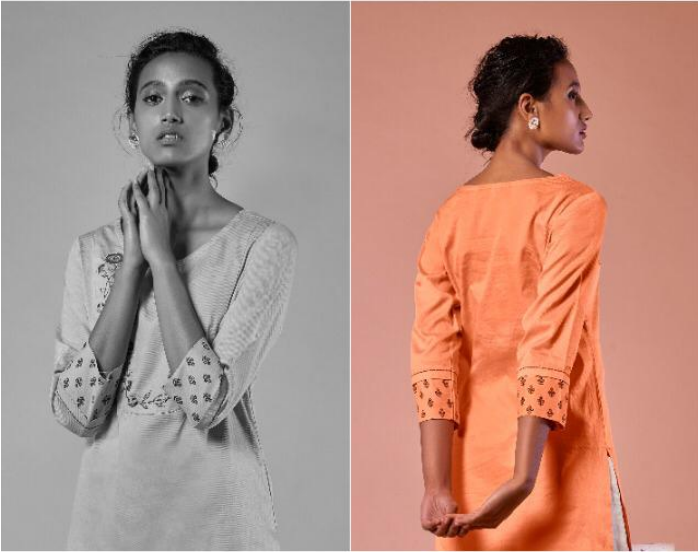
Every individual is an expression of the whole rather than a single section of the whole where it. This collection is all about colored cotton tunics to add a pop to your wardrobe.