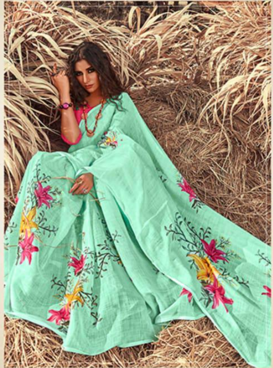
WHEN WE CHOSE TO A SET OF VIVID COLORFUL DESIGN TOLD A STORY ABOUT FASHION.