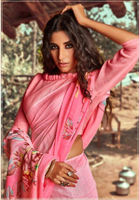
PURE ELEGANCE WITH HARI KANSI FLORAL PATTERNS ON LACI FABRIC AND ADDING GLAMOR TO YOUR STYLE.