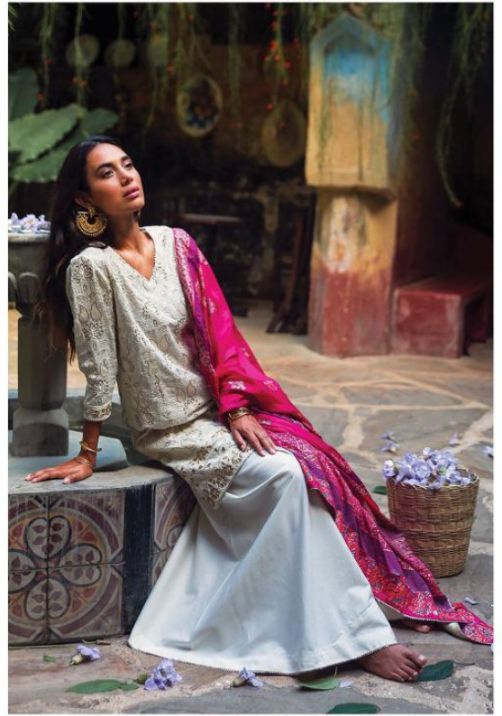
"Fashion is the armor to survive the reality of everyday life."