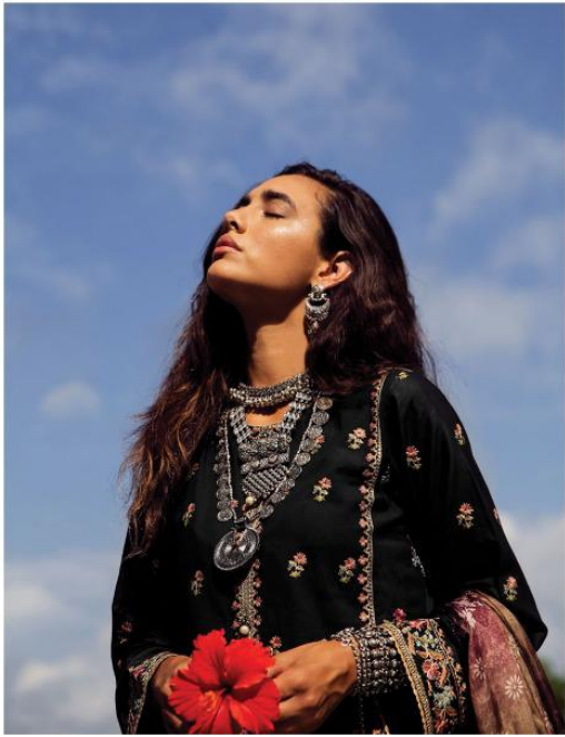
"In difficult times, fashion is always outrageous."