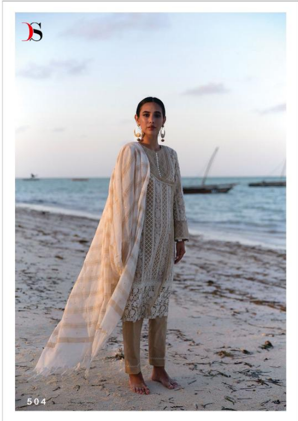
"Luxury is the ease of a T-shirt in a very expensive dress."