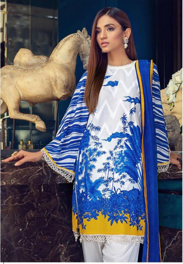
Clothes women nothing until someone lives in them