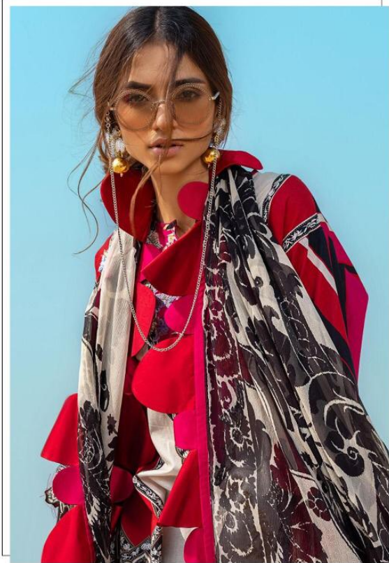
Style is a way to say who you are without having to speak