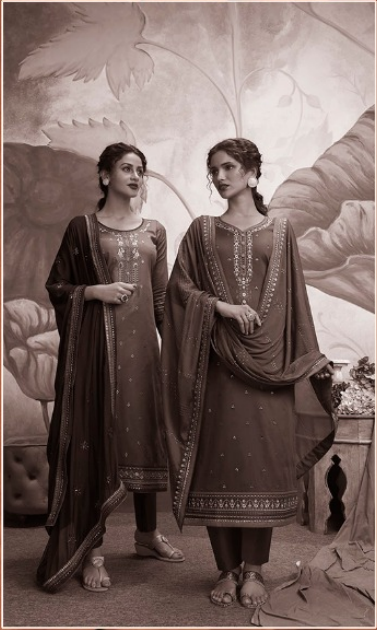
THE ESSENCE OF BEAUTY 113-114