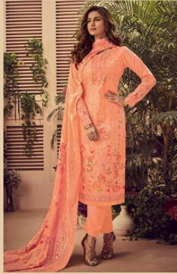
D. NO. 2206