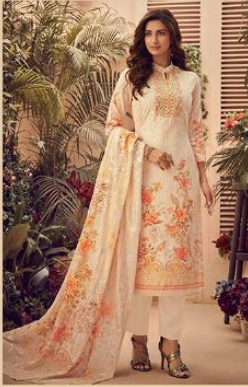
D. NO. 2205