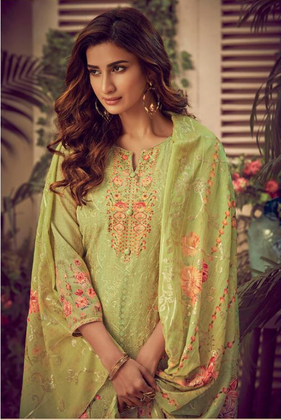
D.NO. 2207 WARMING COLOURS