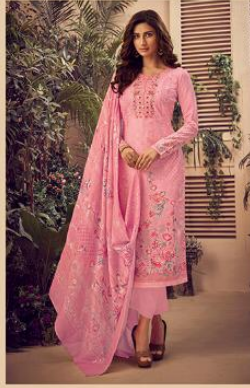
D. NO. 2203