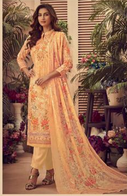
D. NO. 2202