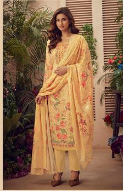
D. NO. 2208