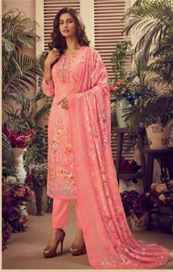
D. NO. 2201