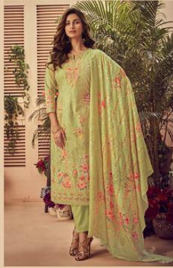
D. NO. 2207