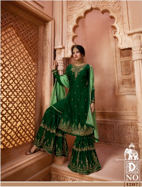
The detailing of work, comfort feel of fabric and flawless finishing effortlessly endows you a look that is certainly an epitome of grace!