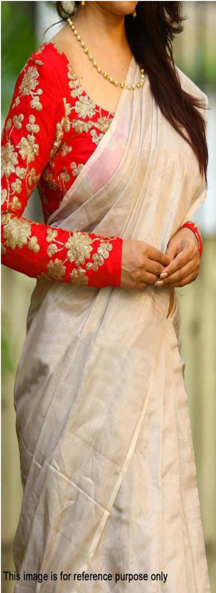
This image is for reference purpose only