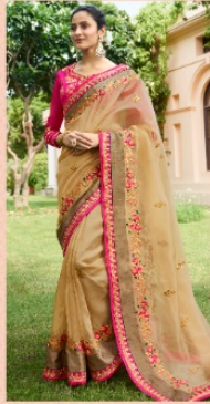
D. NO. : 4112