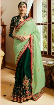
D. NO. : 4111