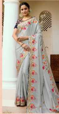
D. NO. : 4113