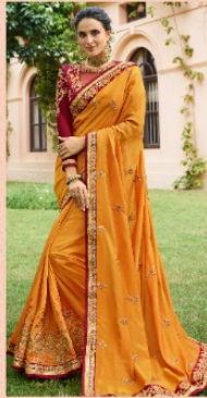
D. NO. : 4116