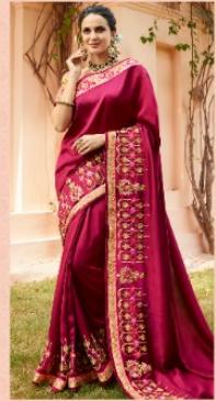
D. NO. : 4118