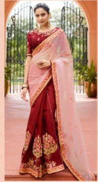
D. NO. : 4114