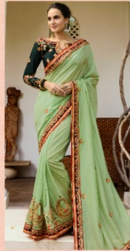
D. NO. : 4117