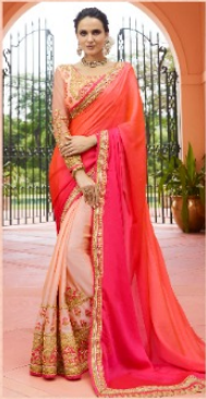
D. NO. : 4115