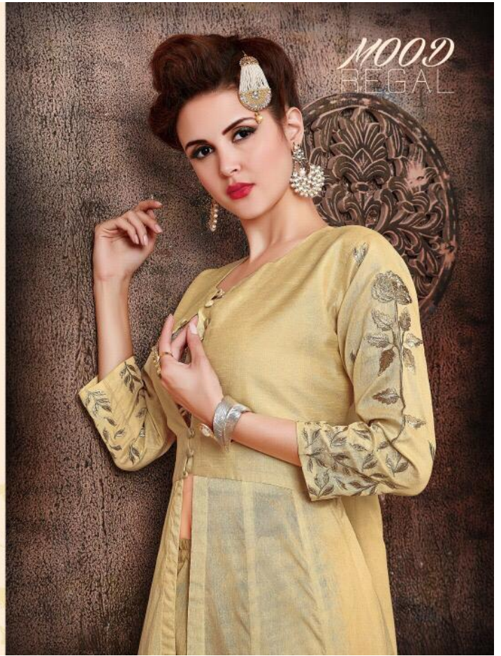
Catch the season's gorgeously feminine mood like collection beautiful designed design and pattern inspired by the beauty of fashion.

The season's most beautiful designed design and pattern inspired by the beauty of fashion. The collection features a mix of colors and patterns, each with its own unique style. Every piece is a work of art, and every detail is carefully chosen to create a look that is both elegant and sophisticated.