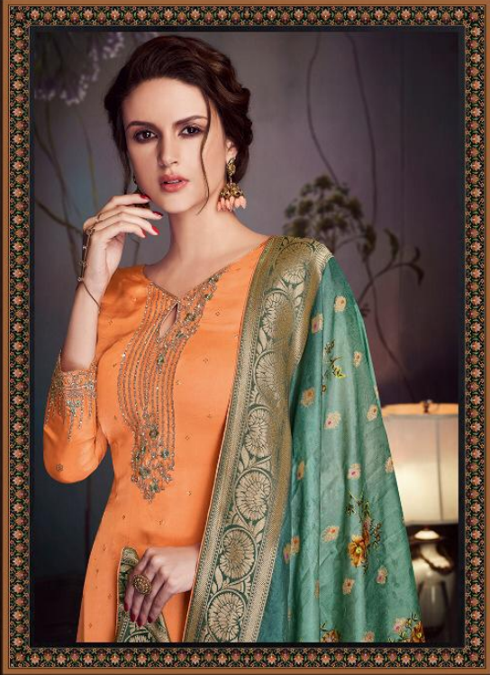
DIFFERENT CULTURES COME TOGETHER IN A TRIBUTE TO FASHION'S BIGGEST MOMENT THIS SEASON. 4544