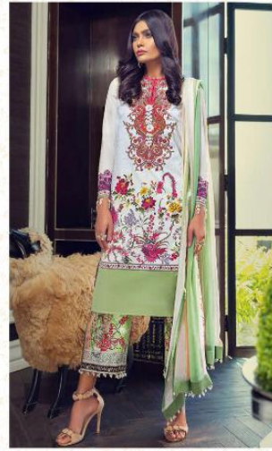
D.N 1003 NX