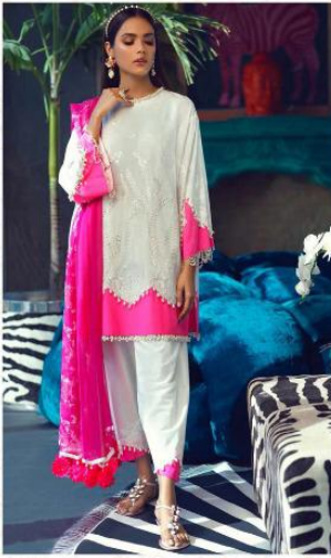
D.N 1001 NX