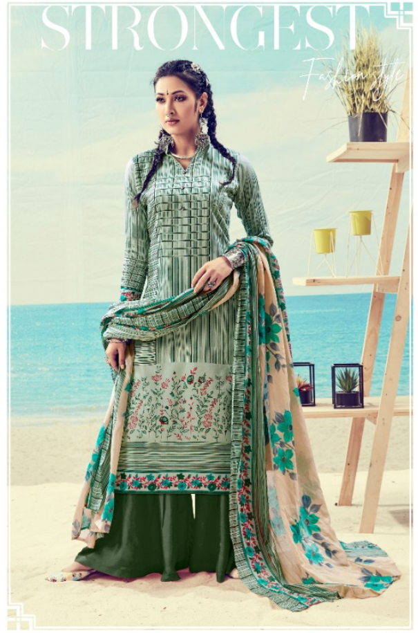
Statement of the season and bold prints give fashion a quite attitude and exotic effect 8002