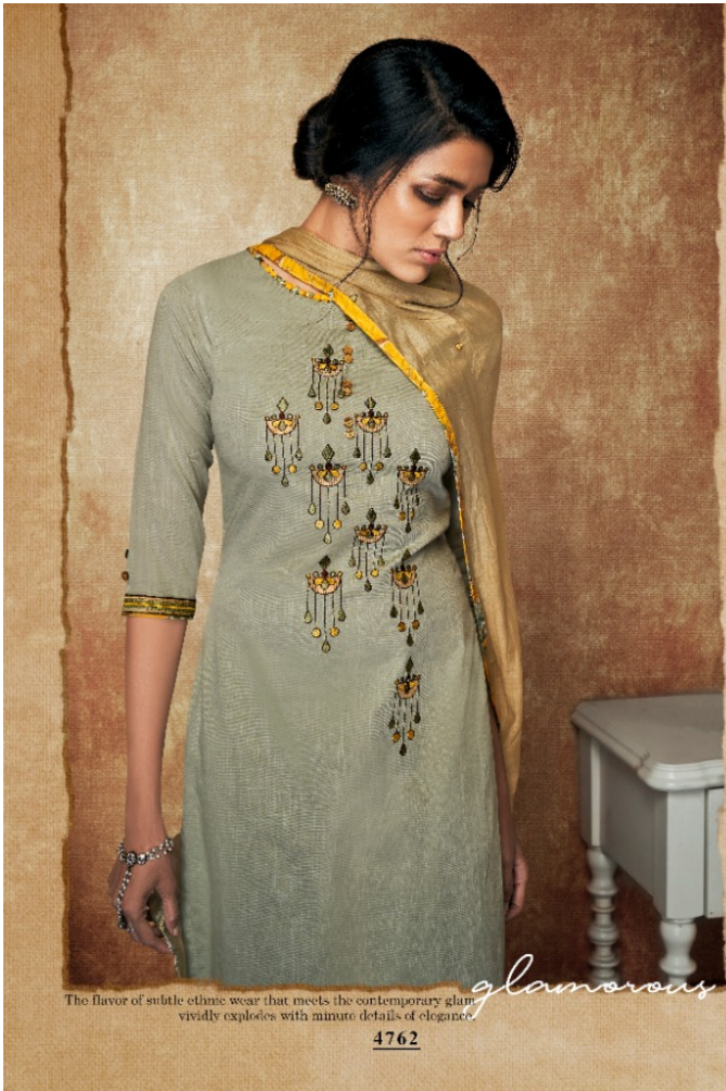
The flavor of subtle ethnic wear that meets the contemporary glam vividly explodes with minute details of elegance