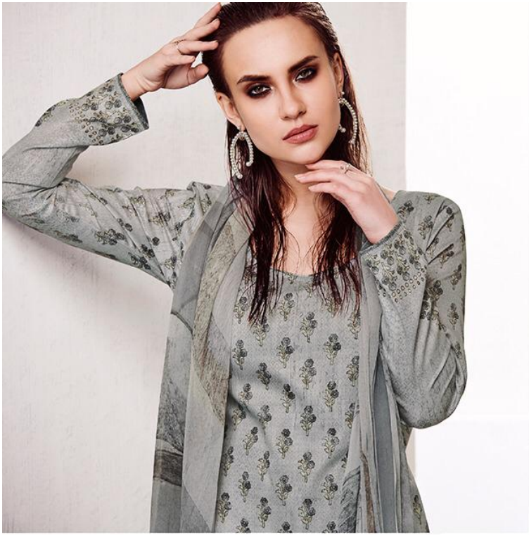
FASHION TREND REPORT THE NEW SEASON