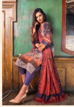
Design * 402