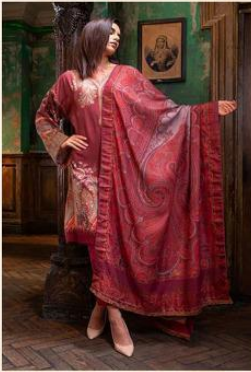
Design * 403