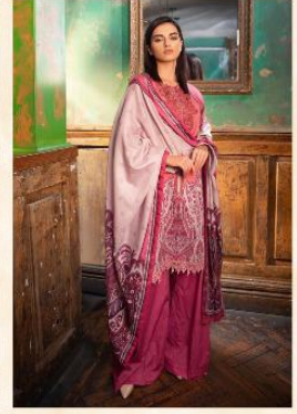
Design * 406