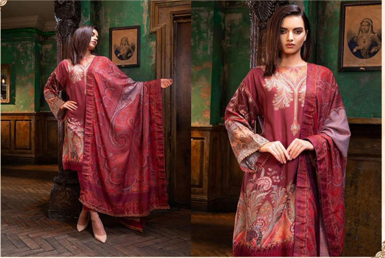
We must never confuse elegance with snobbery Design * 403 .....