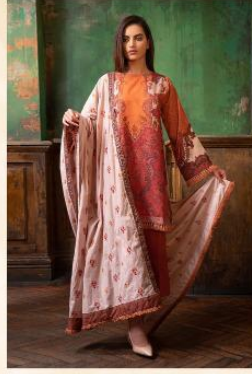
Design * 405