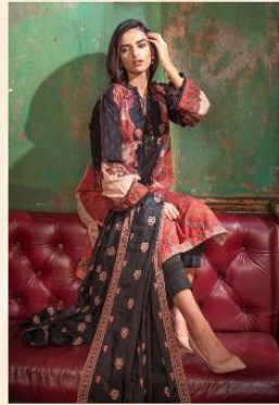
Design * 404