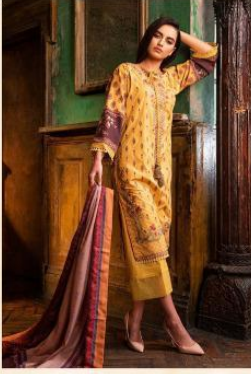
Design * 401