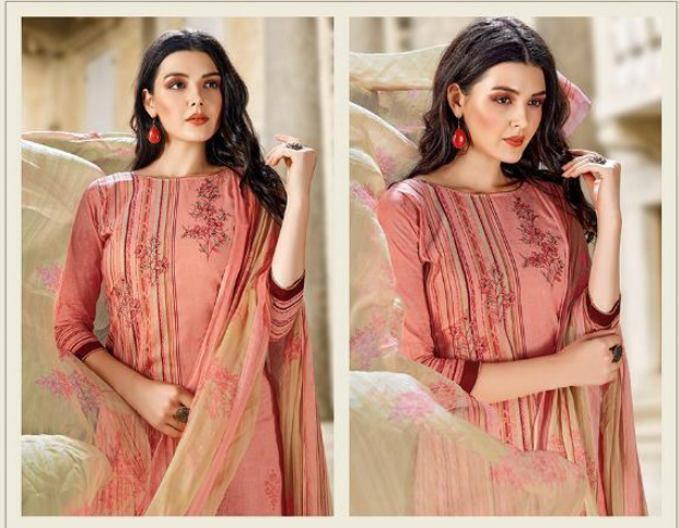
D.no. - 48006

The magnificent and majestic cliffs in the distance, the great embrace of the clean, the perfect carpet of the lush, verdant grass, a truly special atmosphere. And the women in the scene are integral components of this scene. Welcome to the land of perfection.