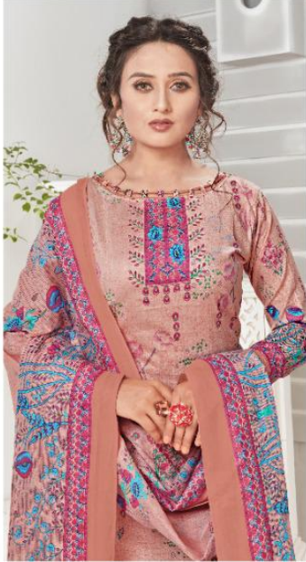
Look with a high awareness of international luxury fashion and readily trends the fashion women in to par with her privileged weather parts around the world. # - 925