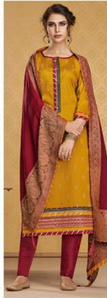
D.NO - 133