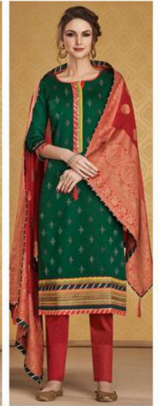
D.NO - 136