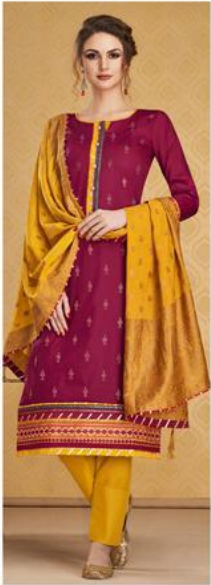
D.NO - 131