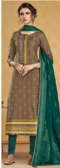
D.NO - 132