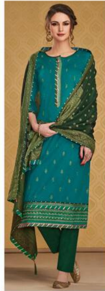
D.NO - 134