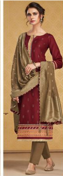
D.NO - 135