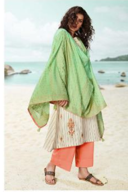
| 1856 |