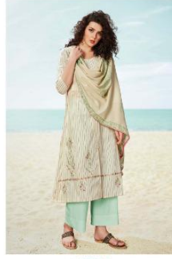
| 1853 |