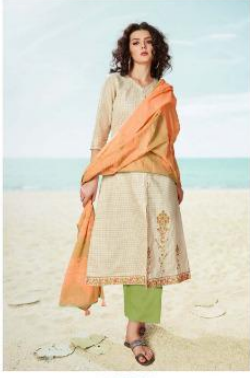
| 1851 |