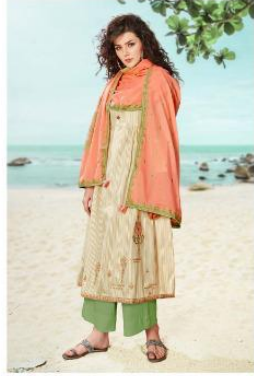
| 1855 |