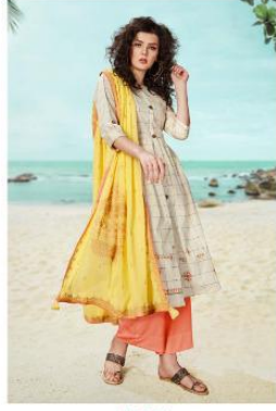
| 1852 |