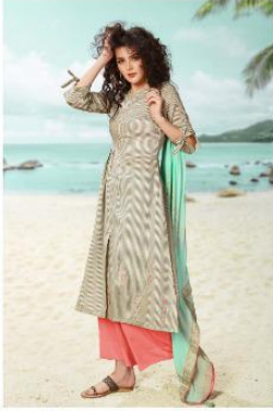
| 1854 |